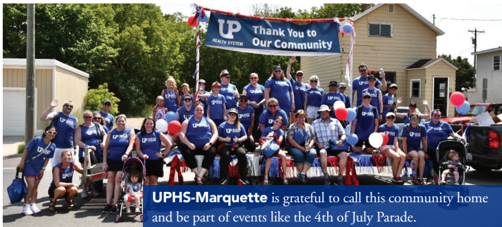
UPHS-Marquette is grateful to call this community home and be part of events like the 4th of July Parade.